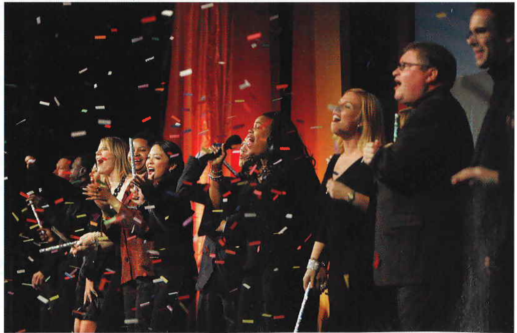
The cast performing the final number for "MCCA On Broadway."