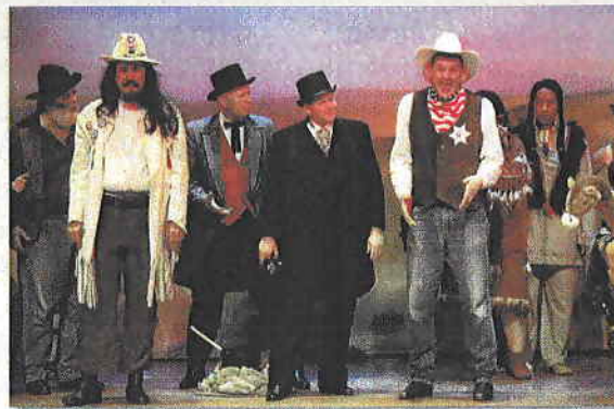
"Scenes from Night Court 2006: The Law of the West."